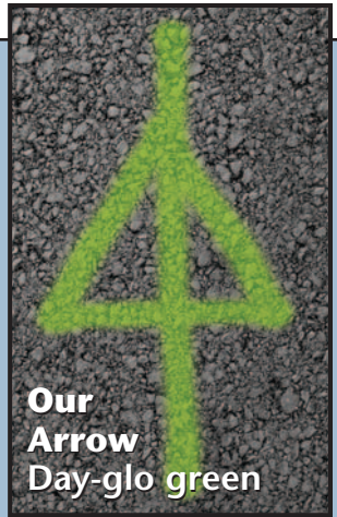
Our Arrow Day-glo green

Thank You! to Harbor to the Bay Ride for providing the printing of the cue sheets. www.harbortothebay.org